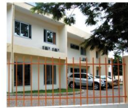
The Teachers Fund Office Building